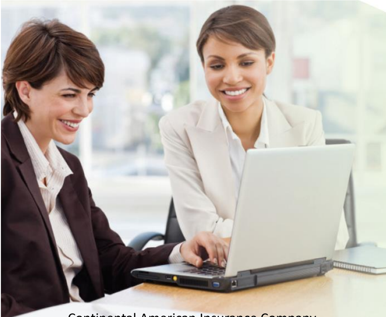
Continental American Insurance Company